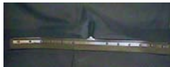
CURVED EDGE FLOOR SQUEEGEE