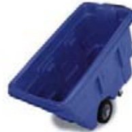
TUT707 BLUE ‘RECYCLE STANDARD-DUTY 750LB. TILT TRUCK Capacity: 750 lbs.; 5.8 cu. yd, 126 gal. Features one-piece, extra-strong, seamless industrial plastic construction. Leakproof bins will not dent, pit, corrode or absorb moisture. 12-gauge 7/8” reinforced/welded tubular steel frame for maximum strength and maximum weight. Easily handled by one person. Easily cleaned with steam or high-pressure hot water. All exposed parts are protected by rust-preventive gray enamel. Equipped with 2-8” ball bearing wheels, 2-1/2” wide and 3” ball bearing swivel casters of solid rubber. Blue with ‘WE RECYCLE’ logo in white on both sides. Measures: 72-1/2” x 33-1/2” x 39-1/2”