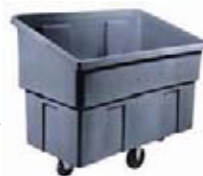
TUT710 12 BU STANDARD DUTY UTILITY TRUCK Manual unloading utility truck has sloped front helps prevent back injuries by allowing easy access to container bottom. Towable option increases productivity. Rugged Rim construction increases durability. Fork pockets & saddle bars enable this item to be used on varying lift systems. 5-inch non-marking swivel casters for quiet transport. Caster placement: Diamond - 2 rigid, 2 swivel. 12 bu Standard duty 46.5” x 28.5” x 42” 700lbs Load rating