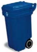
TUT706 50 GAL. BLUE RECYCLE TILT’N WHEEL CONTAINER WITH LID Dimensions(HxWxD): 41” x 23” x 27 1/4” overall

Designed to promote recycling in any environment, this family of products handles recycling from desk-side to curb-side with containers that conveniently promote the separation of waste at the source. Each of these products are manufactured of 20% or more verifiable post-consumer recycled waste plastic. The color cannot fade, chip, peel or ever scratch off. Impervious to rust or corrosion, these containers also will not dent or crack even under extreme weather conditions. ALL RECYCLING RECEPTACLES HAVE THE “WE RECYCLE” IDENTIFICATION.