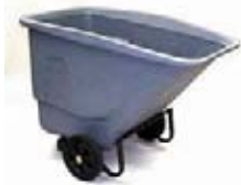
TUT708 1/2 CUBIC YARD UTILITY DUTY TILT TRUCK Universal tilt truck with fork pockets make trucks ready for automation. Rugged Rim construction increases durability in critical wear area. Optional hitch allows towing up to five trucks at once. Quick disconnect wheels for easy cleaning & maintenance. Powder-coating frames prevent rusting & flaking. 1/2 cu yd Utility duty 53” x 32.25” x 37” 400lbs Load Rating. ***Handle not included on this model.