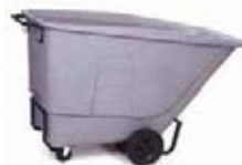
TUT709 1.1 CUBIC YARD STANDARD DUTY TILT TRUCK Universal tilt truck with fork pockets make trucks ready for automation. Rugged Rim construction increases durability in critical wear area. Optional hitch allows towing up to five trucks at once. Quick disconnect wheels for easy cleaning & maintenance. Powder-coating frames prevent rusting & flaking. 1/2 cu yd 1 cu yd Standard duty 72” x 32.5” x 44” 1,200lbs. Load Rating Has handle.