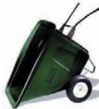
TUT711 17.5 CUBIC FT. TILT CART Collapse the handle for quick & easy storage. Easy to tilt & roll even heavy, bulky loads. Seamless body design allows for easy cleaning. 17.5 cu ft 51.25” x 32.25” x 39.00” (handle collapsed) 800lbs.